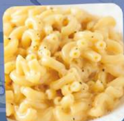
MACARONI CHEESE (V)