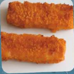
COD FISH FINGERS